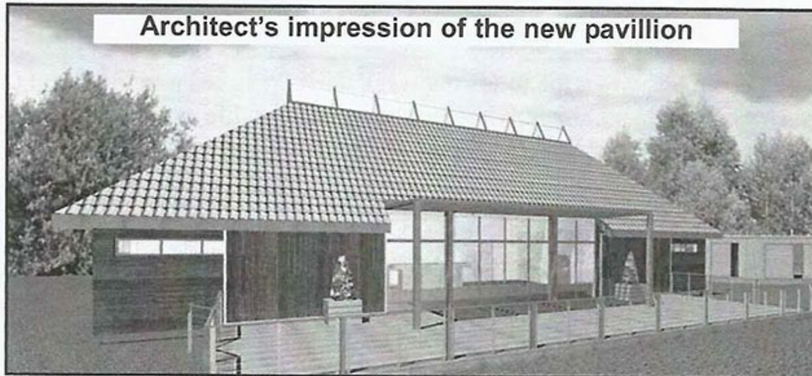
Architect's impression of the new pavillion

Through the combined efforts in applying for grants and organising local fundraising events, the Wethersfield Pavilion Project's target funding of around £460,000 is now well within reach and work now continues apace to pave the way for construction to begin on the new multi-purpose community facility scheduled for the Summer on the village's playing field.