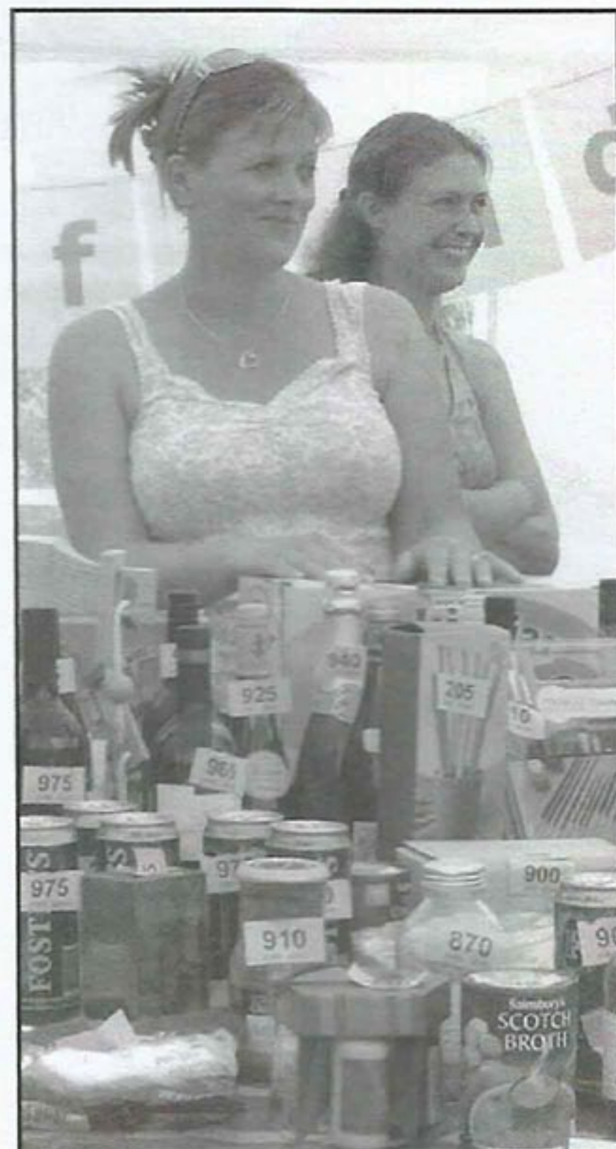
Fun Day Pre-School Bottle Stall

The PFA raised £1500 alone plus an additional £700 for the other groups and societies who held stalls on the day. The sun shone and everybody had an enjoyable day! Thanks to everybody who supported the event