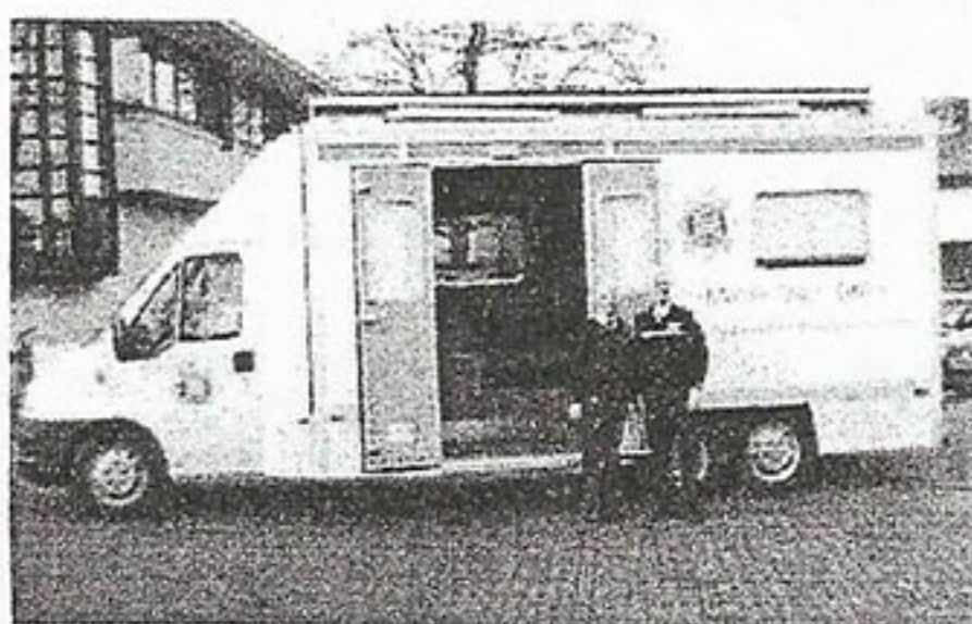
The mobile police Station

Let's make most of our Council Tax and use the systems which have been set up to improve police/community relations and be tougher on crime!